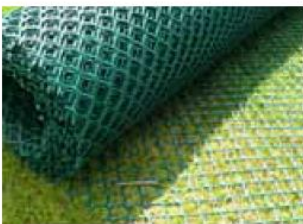
Unroll mesh onto existing grass

d. Care must be taken when first installed prior to the mesh becoming covered and entangled by the grass as Greenfix GTR meshes can be slippery especially when wet. It is advisable that any newly laid areas are cordoned off until the grass has ‘taken over’.