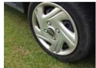
Grass in use after suitable period