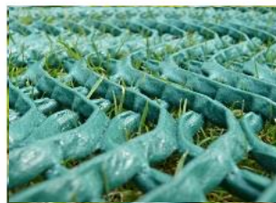
Allow grass to grow through