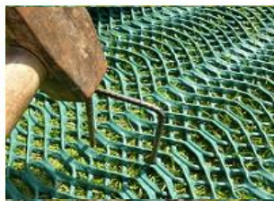
Fix using steel u-pins