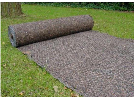
Rockmat F3-2d 1.2 x 25m rolls suitable for slopes up to 75 degrees

In less than five weeks from installation the embankment was fully vegetated. The grasses grow through the fibres, enveloping the mesh to produce a protected grass embankment reinforced by the mesh and is visually attractive.