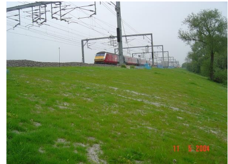
Embankment in 2004 after some establishment had taken place

The slopes were re-graded as a result of the installation of new signalling posts and gantries. 75mm of top soil was placed on the embankment by sub-contractor Joywheel Ltd.