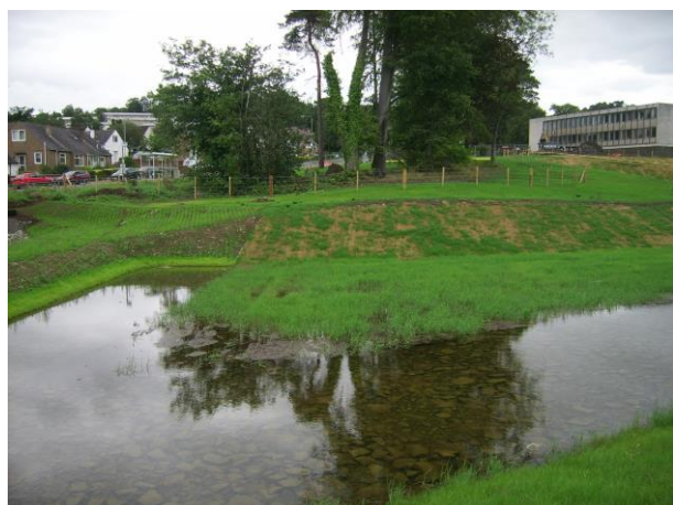
Eromat extended 5m into the pond from the toe of the spillway to ensure immediate protection from soil erosion