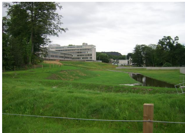
View of new storage pond, capable of holding enough water to fill six Olympic Swimming pools.